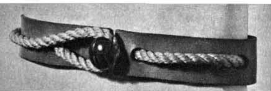
Cowpuncher combination is hemp rope laced through a strip of cowhide

Ready for the big catch—five strands of line encircle her waist and fasten with a collar button. His double line loops over two drawer pulls